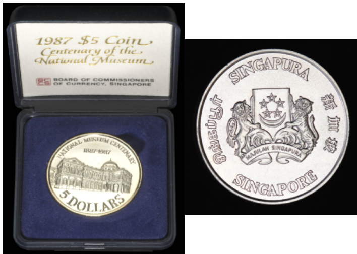
Lot 3: 1987 Singapore $5, Centenary of the National Museum commemorative